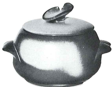
9.25 *4V—2 QT. BAKER/BEAN POT 16.50 *4V/W—BAKER/W WARMER SET