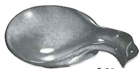
*4Y—6" SPOON HOLDER 3.00