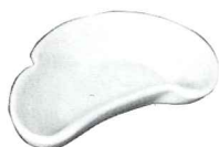
*243—6½" CRESCENT SALAD 2.50