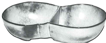
*4QD—11" DIVIDED BOWL 7.75