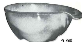
*4X—14 OZ. CEREAL 3.25