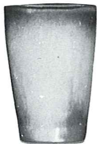
*5L—12 OZ. TUMBLER 3.75