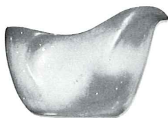
4A—8 OZ. CREAMER 3.25