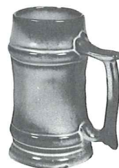
*M2—18 OZ. STEIN 4.50