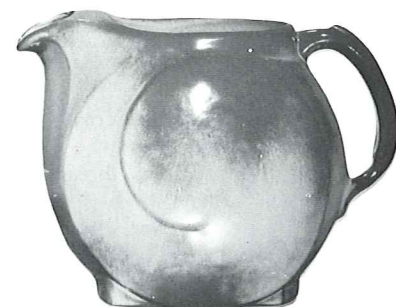
*4D—2 QT. PITCHER 9.25

THIS PAGE AVAILABLE IN PRAIRIE GREEN, DESERT GOLD, BROWN SATIN, COFFEE BROWN & ROBIN EGG BLUE, EXCEPT WHERE NOTED*