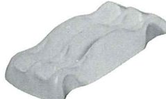
*249 TACO HOLDER BOXED 2 PER BOX 10.00 Not Available in Flame