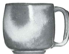
*4M—18 OZ. MUG 4.50