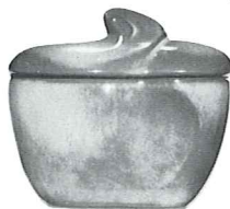
4B—SUGAR WITH LID 5.00