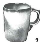
*5CC—5 OZ. TEACUP 2.75