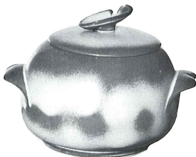
13.25 *4W—3 QT. BAKER/BEAN POT 20.50 *4W/W—BAKER/W WARMER SET