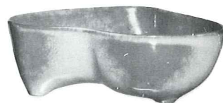
*4N—24 OZ. VEGETABLE 4.75