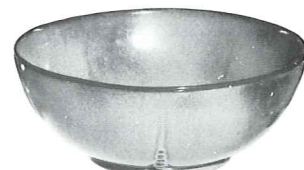
*224—8" ROUND BOWL 6.50