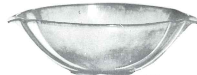
*201—9" BOWL 4.75