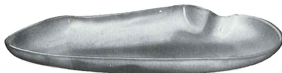
*4P—13" PLATTER 7.75